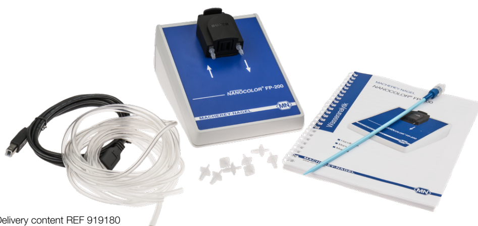
Delivery content REF 919180