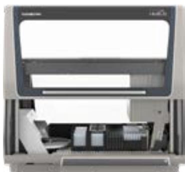
The Nimbus ® Presto workstation combines liquid handling and magnetic rod processing for fully automated, high throughput nucleic acid extractions.