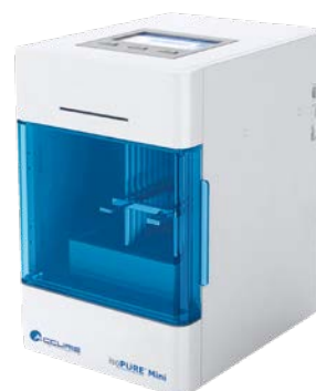
IsoPure Mini nucleic acid extraction system

The data on the right indicate a cross-contamination free workflow for the processing of MACHEREY-NAGEL NucleoMag® kits on the IsoPure Mini automated extraction robot. No qPCR signals were detected in the wells containing negative controls (RNase-free H 2 O).